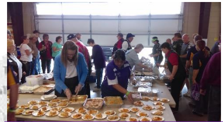
Bluebonnet Rally Lunch Line