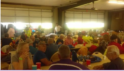
K2 at Bluebonnet Rally