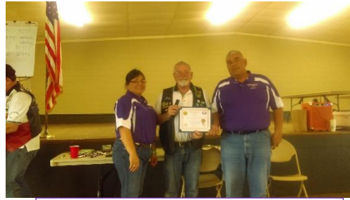
NEW K2 DIRECTORS